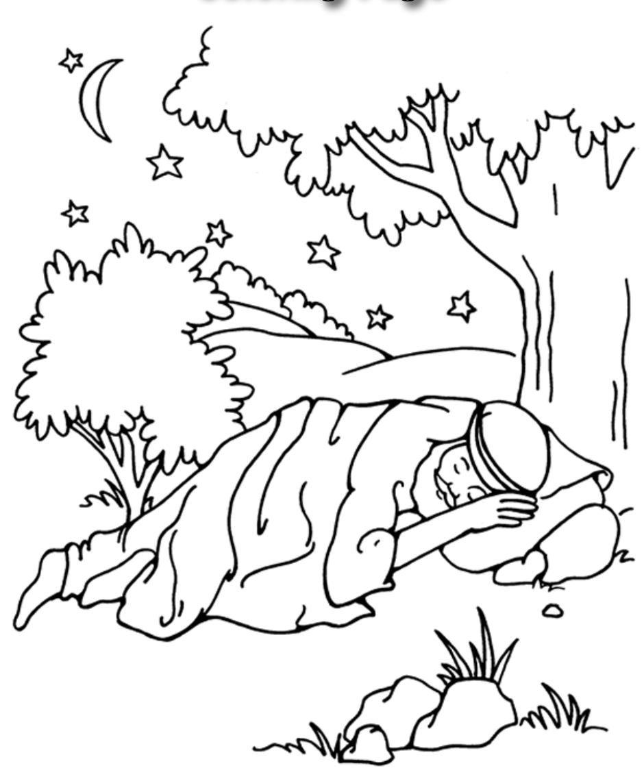
God Cares for Jacob

From Thru-the-Bible Coloring Pages for Ages 4-8. © 1986,1988 Standard Publishing. Used by permission. Reproducible Coloring Books may be purchased from Standard Publishing, www.standardpub.com, 1-800-543-1301.