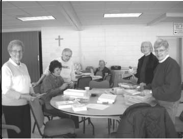
March Faith Crafters Meeting

Faith Crafters and Stitchers will meet Thursday, April 10 , from 1:00-3:00 p.m. in the Fellowship Hall . You are welcome to bring your own project to work on or there will be Bazaar 2014 projects you may work on if you wish. Bring a friend and join us for work time, fellowship, coffee, and snacks.