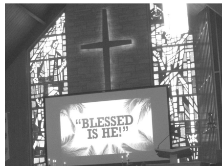
The first Sunday (Palm Sunday) of using the screen.