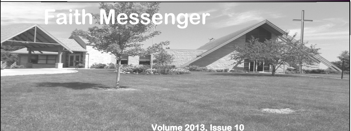
Volume 2013. Issue 10